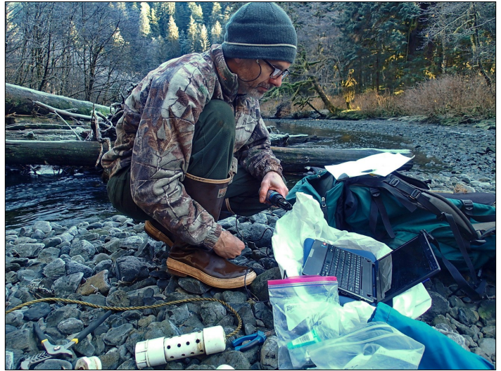
Water temperature data collection is relatively easy with the availability of low cost data loggers, which offer good accuracy and reliability, and can be left instream year-round.