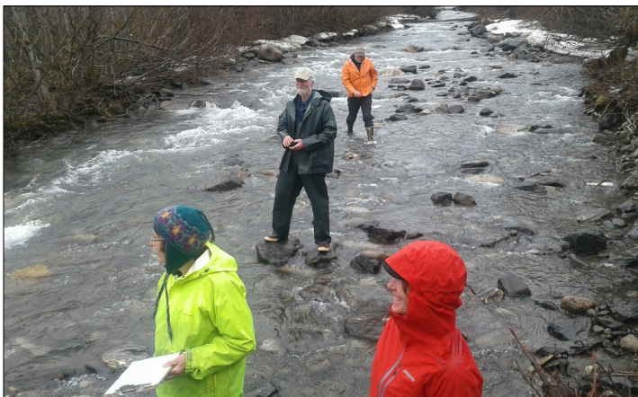
Potential partners participated in a training session in May 2017 to learn about minimum data standards and tips for site selection.

A network memorandum of understanding will provide confirmation of each partner's commitment and accountability to ensure a successful collaborative effort. With these commitments, we will be able to accurately assess the rate of change of Southeast Alaska's watersheds and the implications for freshwater resources, thus providing managers with better information for decision-making.