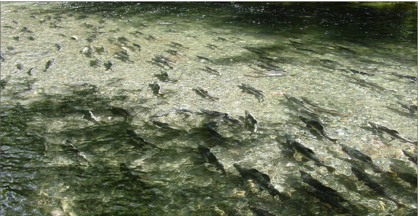
Shifts in the timing of Pacific salmon populations returning to Southeast Alaska watersheds may be one adaptive response to changing thermal conditions in streams and lakes.

entists to sort out these responses. For example, in Southeast Alaska, declines in egg and sperm viability have been observed in Pink salmon when stream temperatures exceed 15°C during the spawning migration. Partly due to warming water, Coho salmon currently return to Auke Creek to spawn 17 days earlier than they did in the 1970s. However, increased summer temperatures in Auke Lake increased the biomass of juvenile Coho and Sockeye salmon smolts the following fall, implying that moderately higher temperatures will positively affect some salmon life history stages while negatively impacting others.